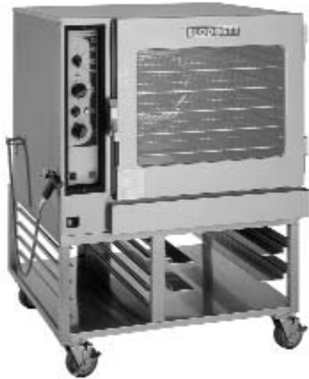
Shown with optional floor stand and casters

Single or Double Gas Boilerless Combination-Oven/Steamer