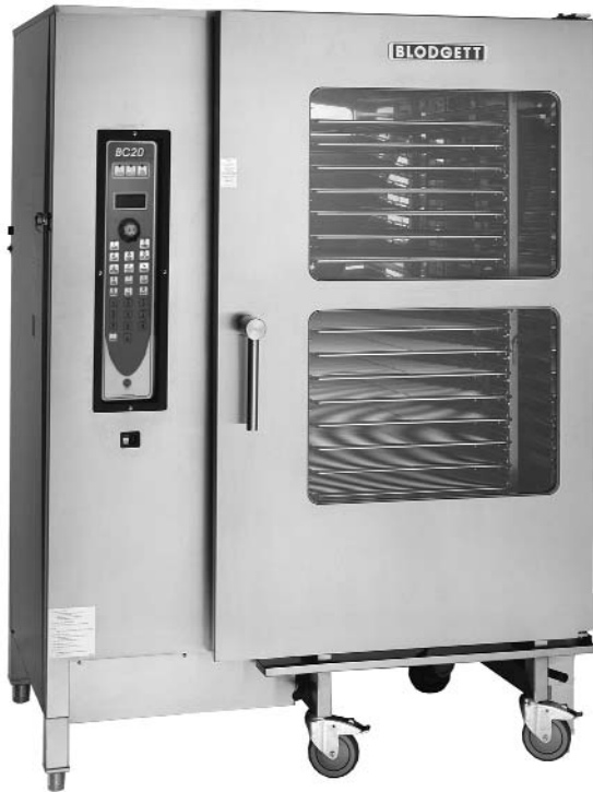
Shown with optional MenuSelect control