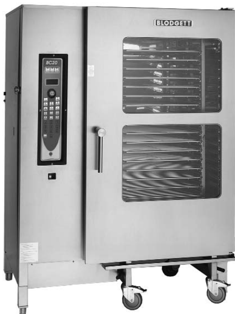
Shown with optional MenuSelect control