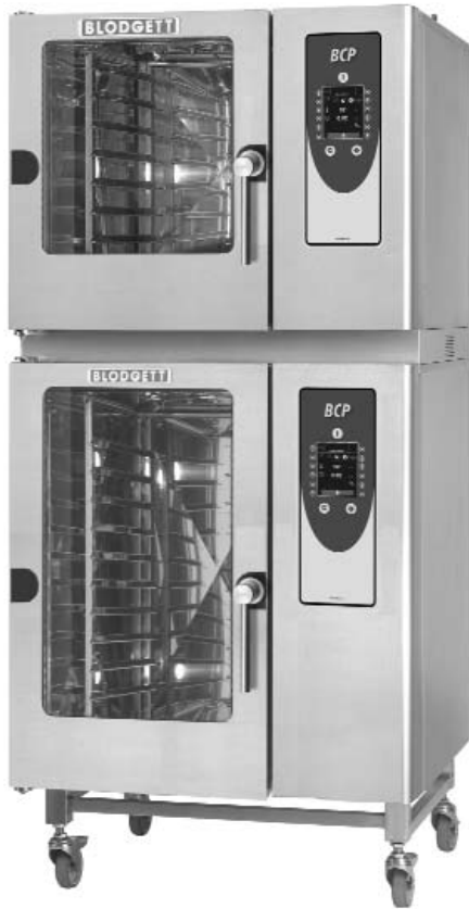
Shown on optional casters