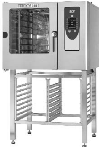
Shown on optional stand with runners and adjustable feet

Boilerless Combination-Oven/Steamer with Programmable Control