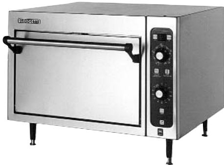
Model 1405 shown with manual controls