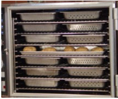
BC-14 with both hotel and sheet pans

it automatically pumps in the correct amount of solution. What could be easier?