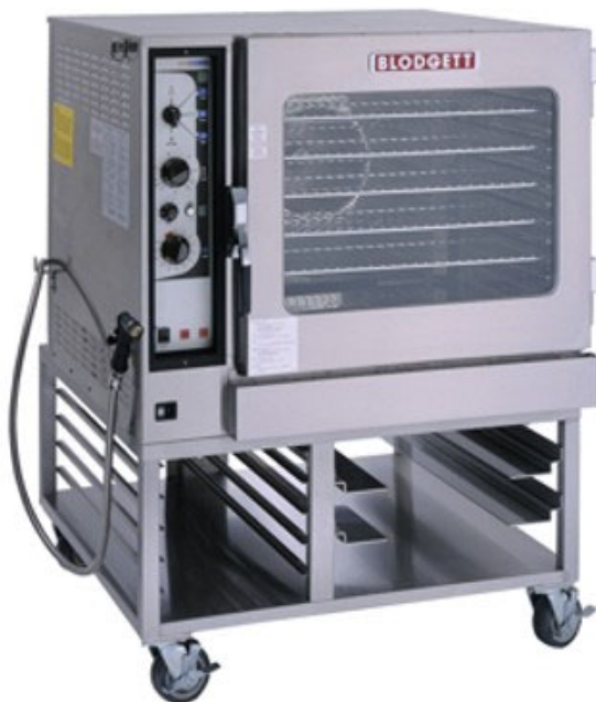
BC-14G gas oven shown with optional stand and casters