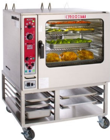
Blodgett BCX-14G Combi shown with optional stand and casters.