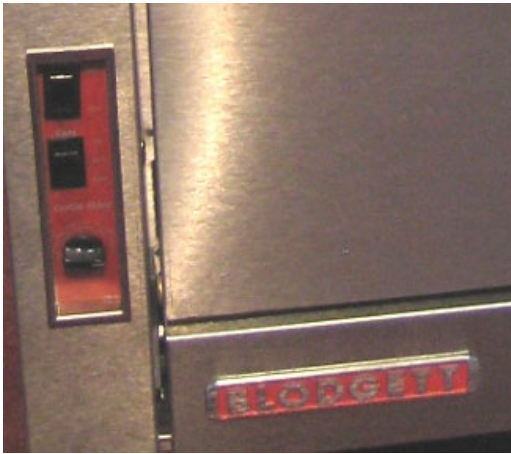
NEW Redesigned Recessed Oven Control Panel