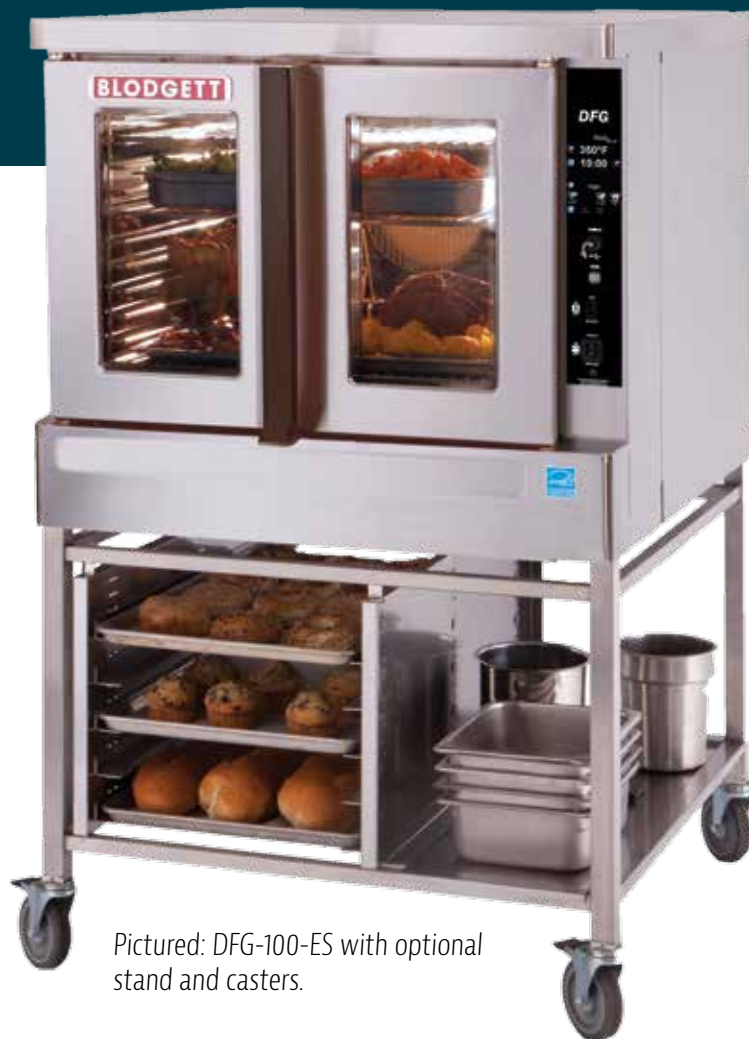
Pictured: DFG-100-ES with optional stand and casters.

Ovens can be single or double stack. DFG-200, Zephaire-200 are bakery depth. All other ovens are standard depth.