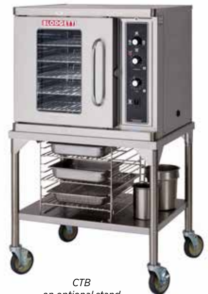
CTB on optional stand