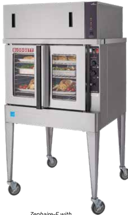
Zephaire-E with VLF hood