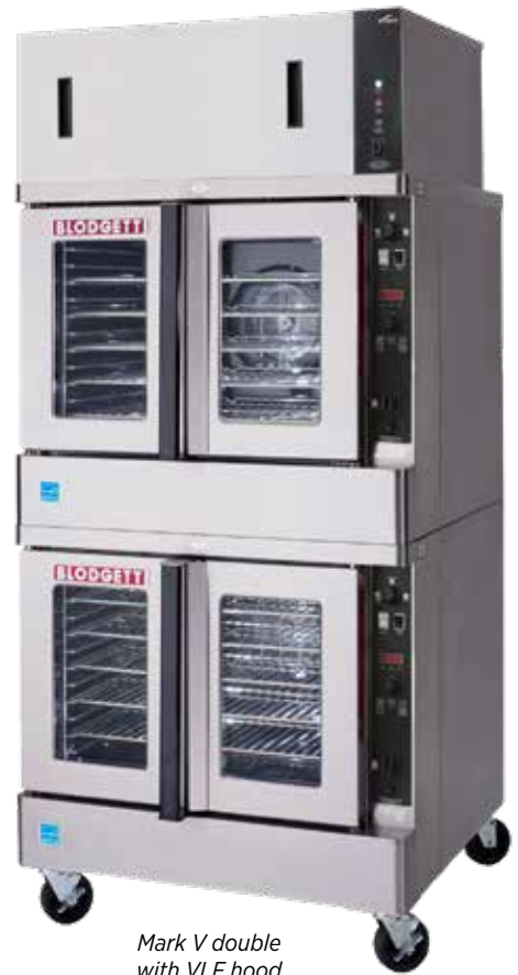
Mark V double with VLF hood