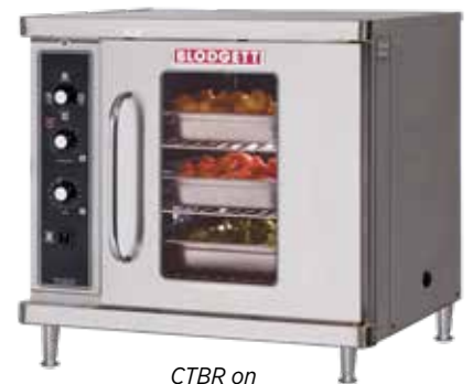
CTBR on standard 4" legs

ES ovens reduce your carbon footprint by 2,544 lbs of CO 2 per year!