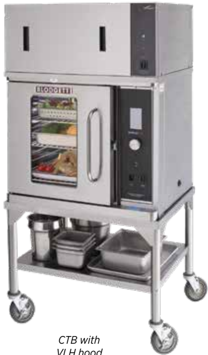
CTB with VLH hood