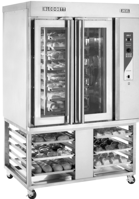
XR8-E with 12 pan stand